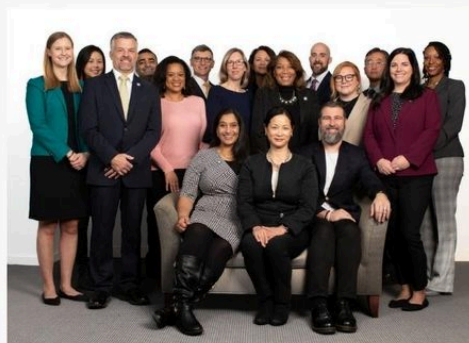
Office of the Executive Director