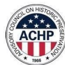
Advisory Council on Historic Preservation