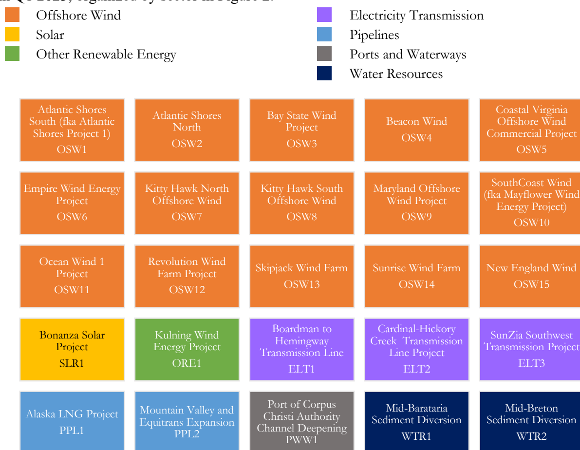
Figure 2: List of covered projects undergoing active Federal review in Q1 2023.

The FAST-41 project portfolio consists of “covered projects,” as defined at 42 U.S.C. § 4370m(6). This report focuses on a subset of covered projects, those undergoing active Federal review during Q1 2023. Projects undergoing active review are projects that were, at any time in Q1 2023, not canceled, complete, or paused. 24 There were 25 active FAST-41 covered projects in Q1 2023, organized by sector in Figure 2. 25