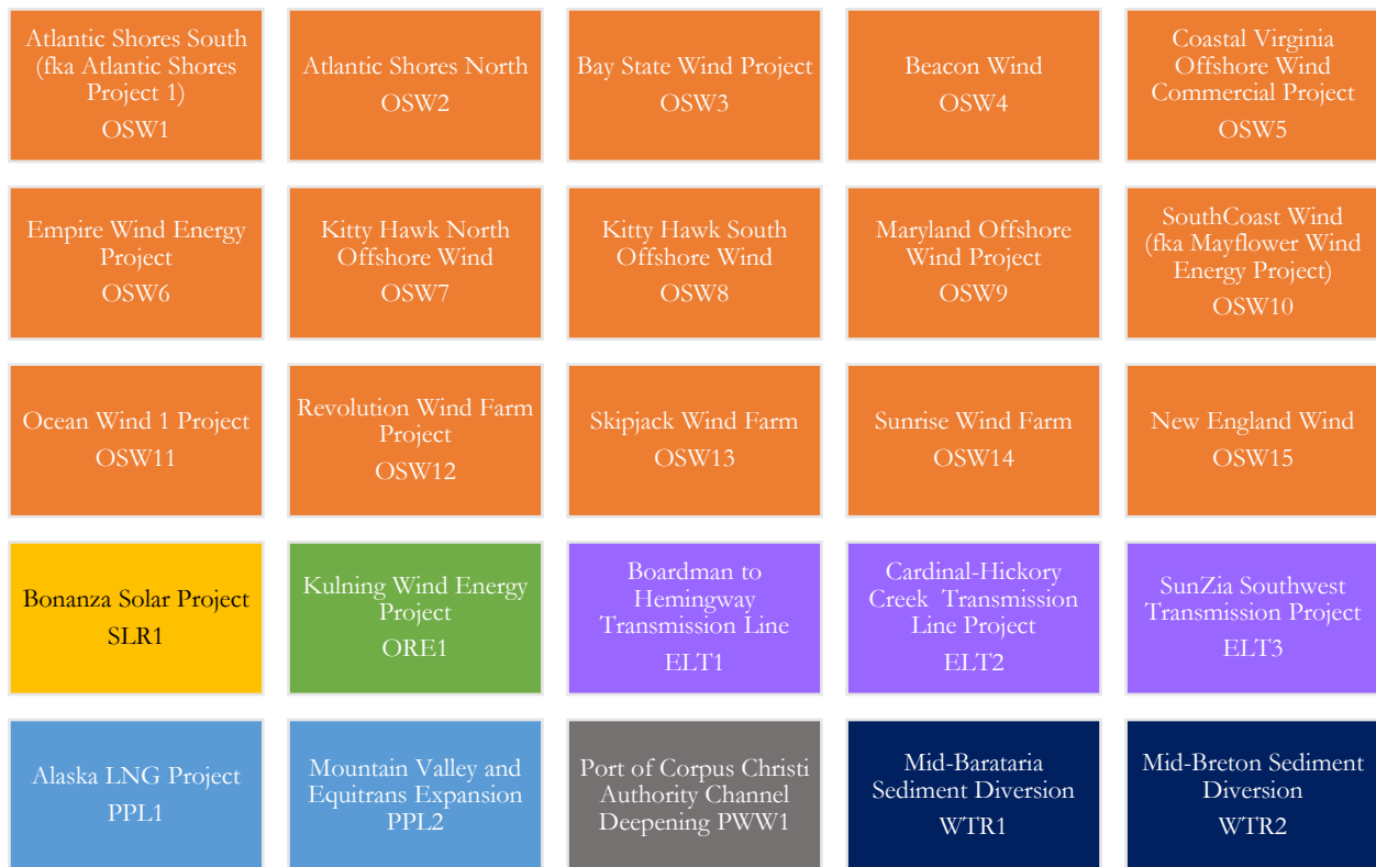
Figure 1: List of covered projects undergoing active Federal review in Q1 2023.

The appendix section of this report includes further description of the FAST-41 covered project portfolio for the first quarter of Fiscal Year 2023.