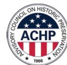
Advisory Council on Historic Preservation